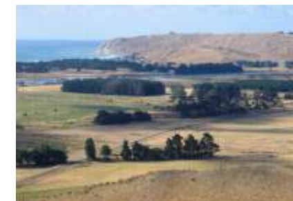
Photo: Porangahau River and Pukepuketauhinu, Porangahau.