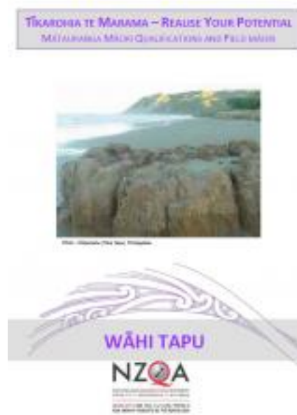
Wāhi Tapu (PDF, 482KB)