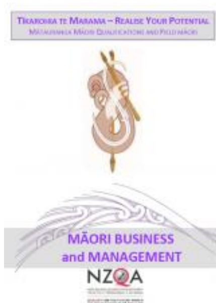
Māori Business and Management (PDF, 389KB)