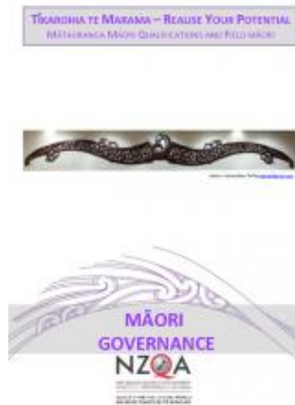
Māori Governance (PDF, 555KB)