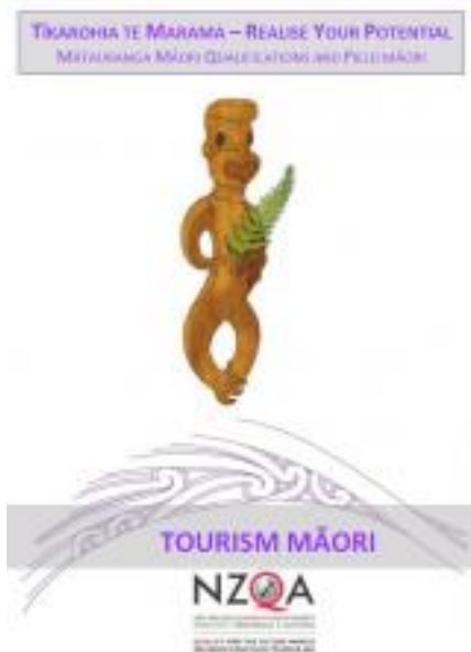
Tourism Māori (PDF, 422KB)