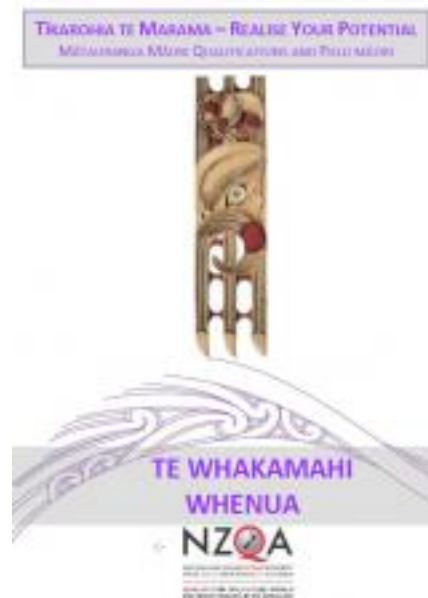
Te Whakamaahi Whenua (PDF, 429KB)