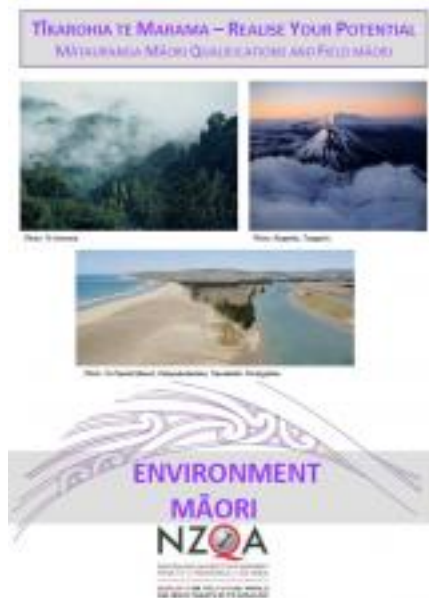
Environment Māori (PDF, 494KB)

Information about the new mātauranga Māori qualifications is available in the pamphlets below.