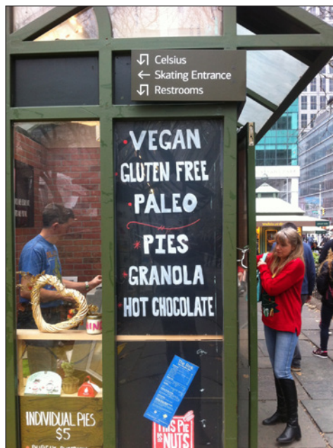
The menu at a New York café.