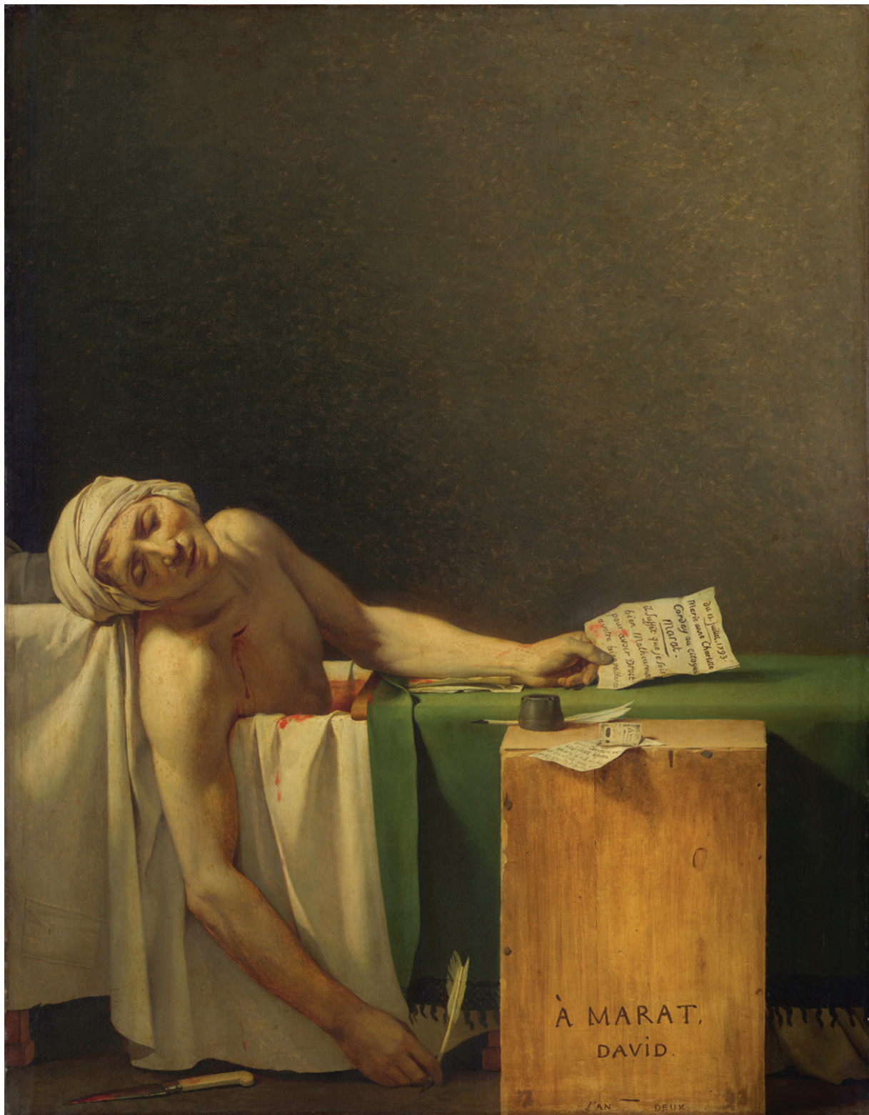
Plate 7: Jacques-Louis David, Death of Marat , 1793, oil on canvas, 165 × 128 cm, Royal Museums of Fine Arts of Belgium, Brussels