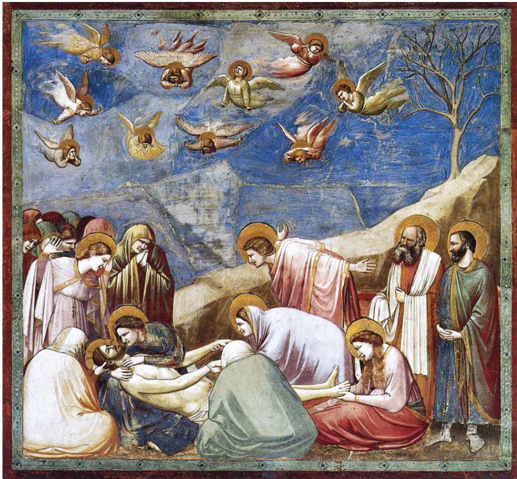
Plate 4: Giotto di Bondone, Lamentation (The Mourning of Christ) , c.1305, fresco, 200 × 185 cm, part of the fresco cycle in the Scrovegni (Arena) Chapel, Padua, Italy