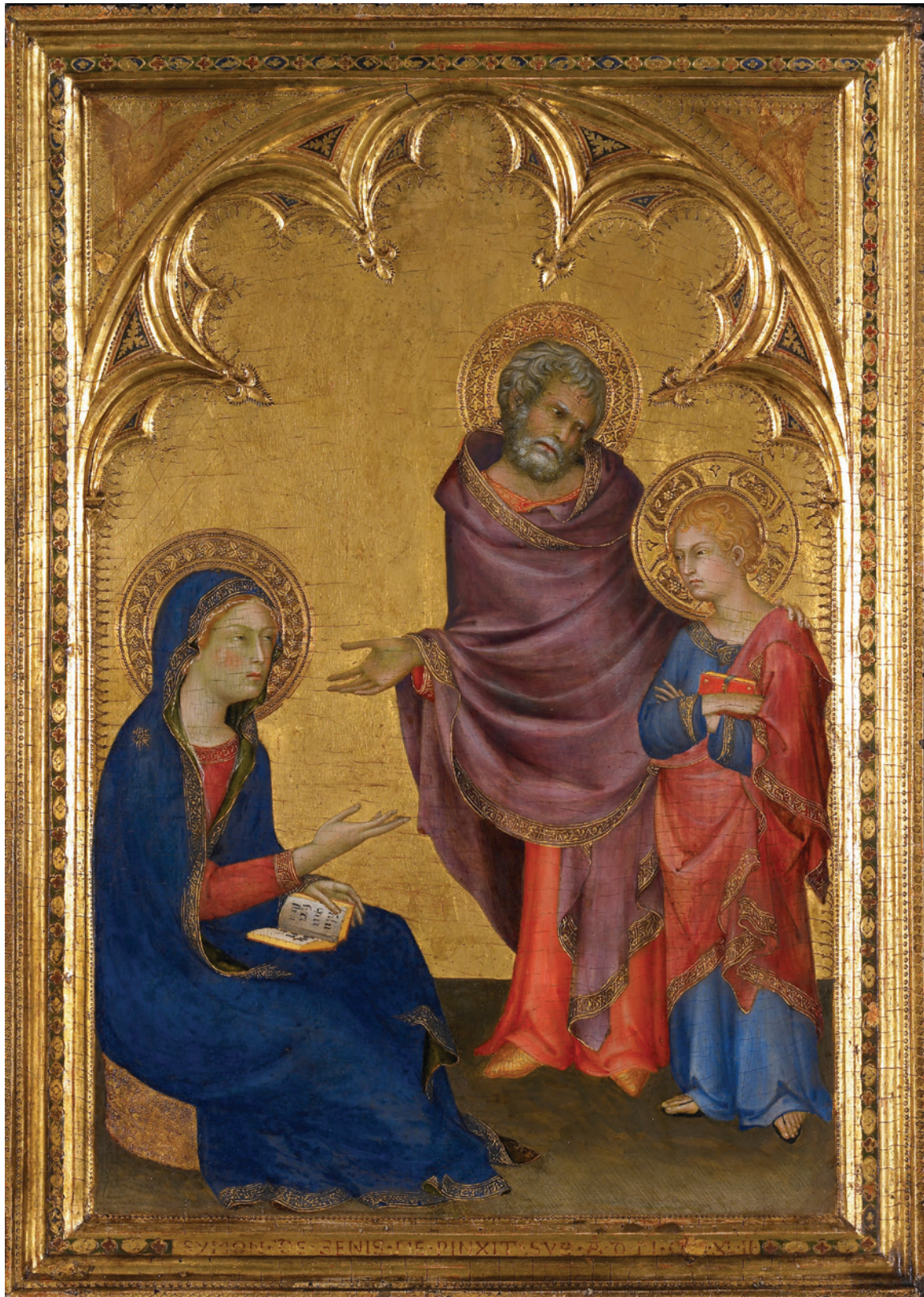
Plate 5: Simone Martini, Christ Discovered in the Temple , 1342, tempera and gold leaf on wood panel, 49.5 × 35.1 cm, Walker Art Gallery, Liverpool, England