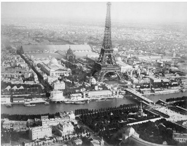
Aerial view of Paris from a balloon, showing the River Seine and the Eiffel Tower, surrounded by buildings of the Exposition Universelle, 1889. Photographic print: albumen