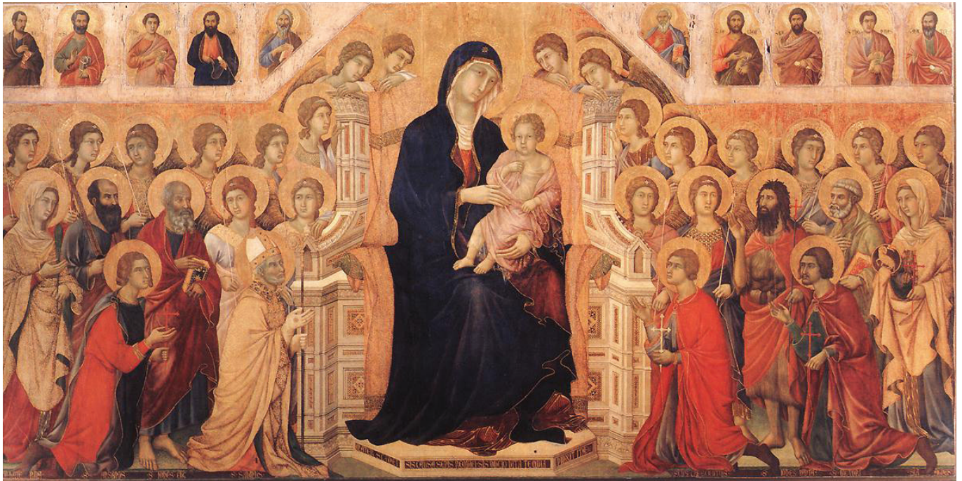
Plate 1: Duccio di Buoninsegna, Maestà , 1308–1311, tempera and gold on wood, 213 × 396 cm, Museo dell'Opera Metropolitana del Duomo, Siena, Italy