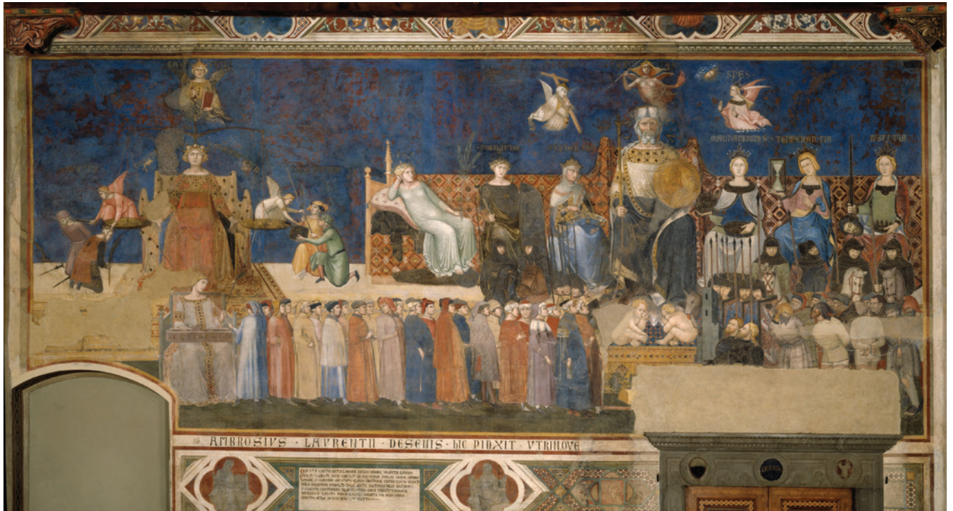
Part of the room featuring the frescoes of Good and Bad Government