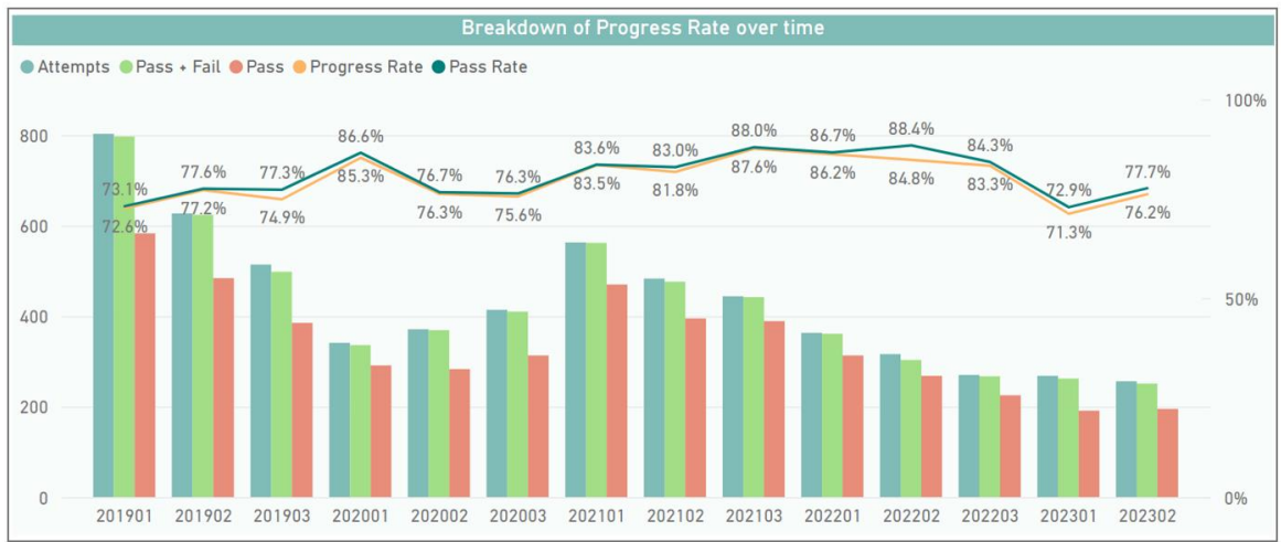
Table 1: UCIC Overall Pass and Progress Rates

Note: the scale on the left shows number of assessment attempts which broadly correlates with the number of students enrolled each trimester. This number has declined because of the pandemic. The top trend line in green, and the percentage rates above it show the pass rate. Bottom scale shows each trimester since the last EER in 2019.