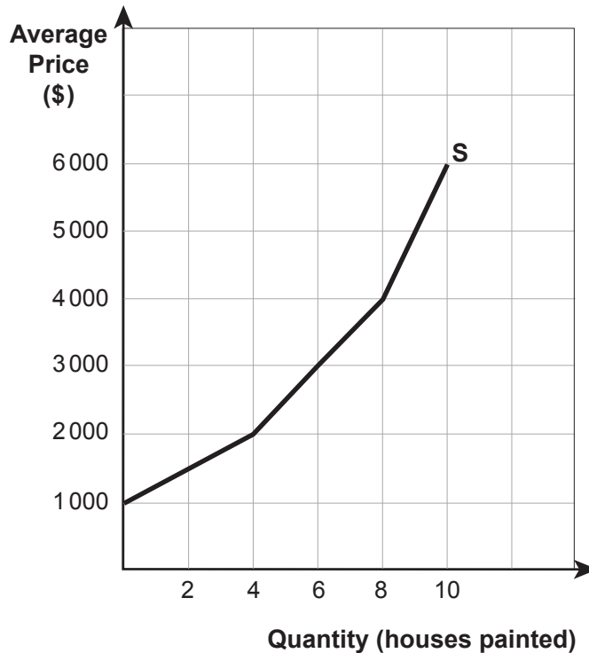
Jessie's monthly supply of house painting services

The number of houses she paints per month depends on the price she can charge. The graph below shows Jessie's monthly supply of houses painted.