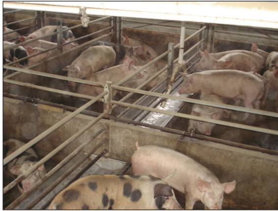
An intensive pork production piggery

A majority of indoor-produced pigs are group housed, which means that they share their pen with other pigs.