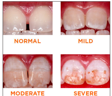
Fluorosis of the teeth

non-fluoridated areas in the 2009 “Our Oral Health Survey” conducted by the Ministry of Health.