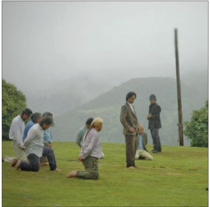
A re-enactment of the arrest of Rua Kēnana at Maungapōhatu.

During the First World War, significant elements of New Zealand society became intensely patriotic 1 , but also sharply intolerant.