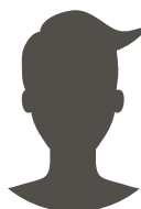
Simone B Tourist

The Grand Canyon is such a beautiful and breathtaking environment—it's simply spectacular. Therefore I am concerned that the Escalade will cause overcrowding. On the other hand, at the moment the only way to see the bottom of the canyon is to ride a mule down. That is something not everyone, including me, can do. So if the Escalade is built it will allow all people to access and enjoy this beautiful place.