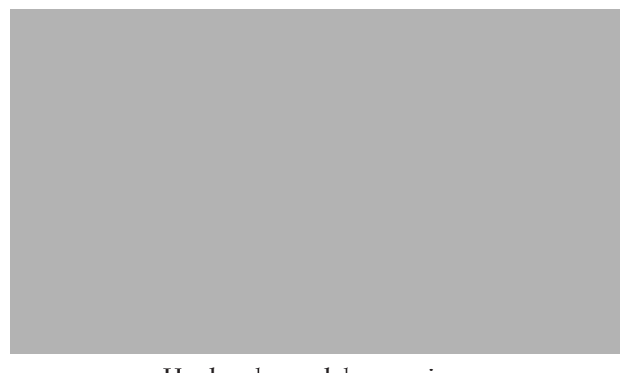
Huelga de modelos en vivo