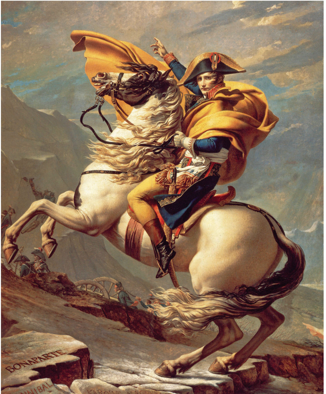
Plate 1: Jacques-Louis David, Napoleon Crossing the Alps , 1800–01, oil on canvas, 259 × 221 cm, Château de Malmaison, Rueil-Malmaison, France