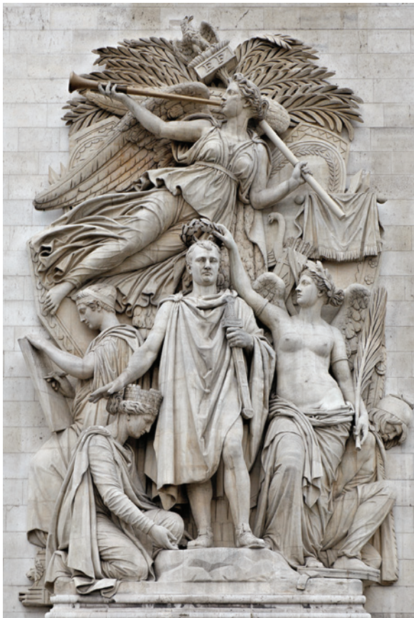
Detail: Jean-Pierre Cortot, The Triumph of 1810 , sculpture featuring Napoleon crowned by the goddess of Victory, 1833.