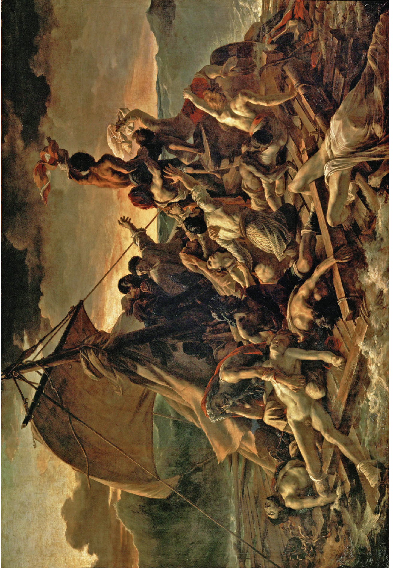
Plate 3: Théodore Géricault, Raft of the Medusa , 1818–19, oil on canvas, 490 × 716 cm, Louvre, Paris, France