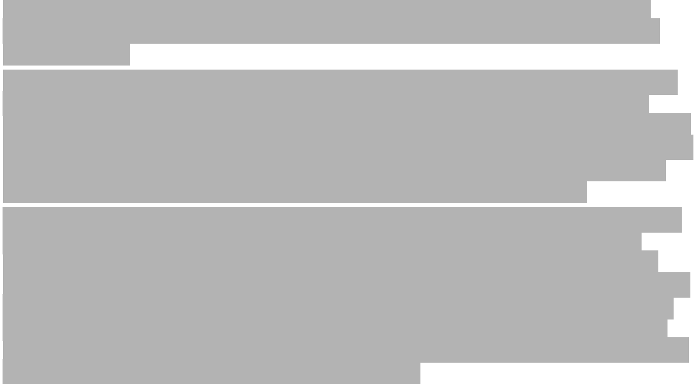
Figure 1: Personality traits are not binary

Developed during World War II, the Myers-Briggs Type Indicator, or MBTI, is likely the