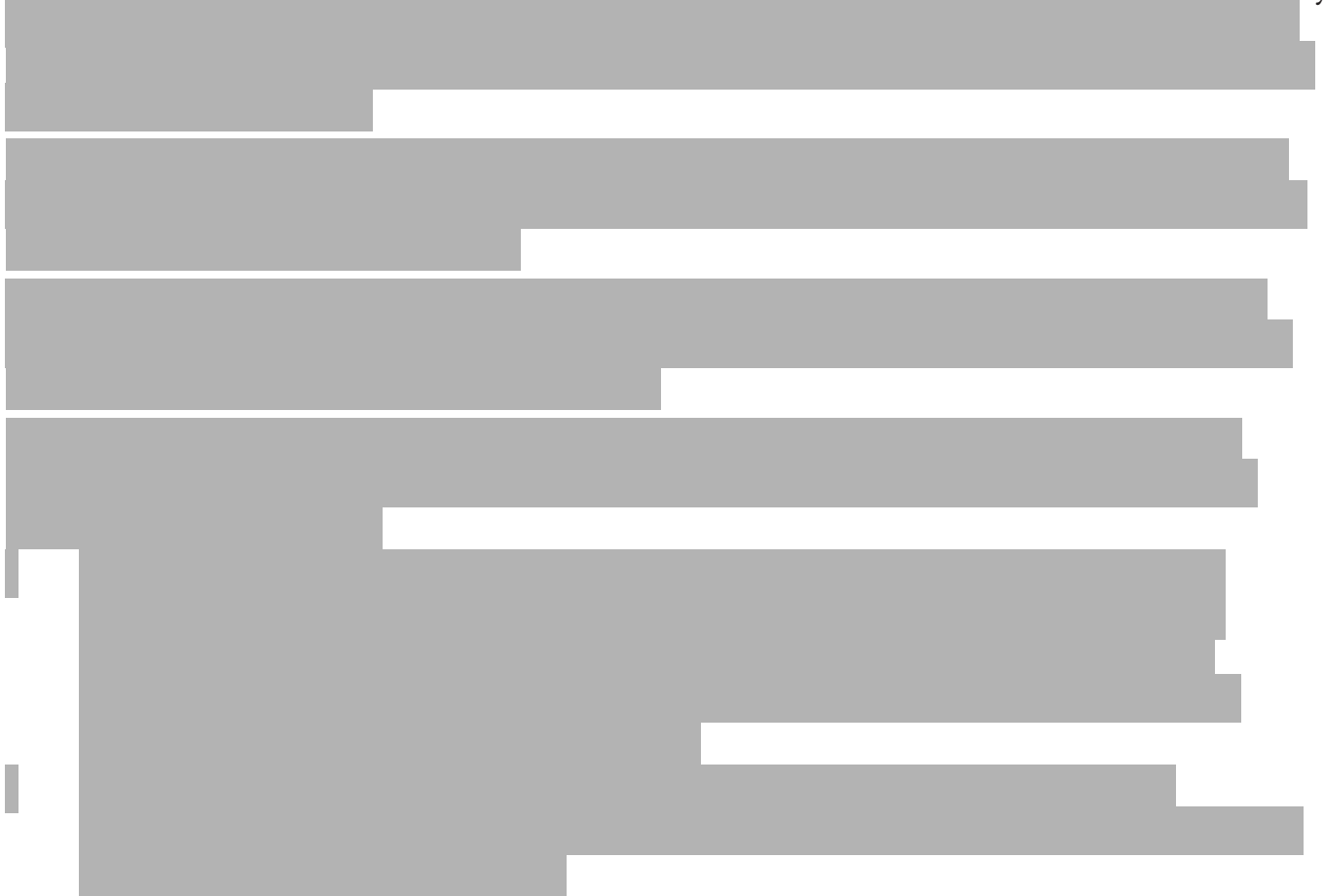
Figure 5: Plastics that are biobased / fossil-based and non-biodegradable / biodegradable

It's important to be on the lookout for misleading marketing. For example, plastic products may