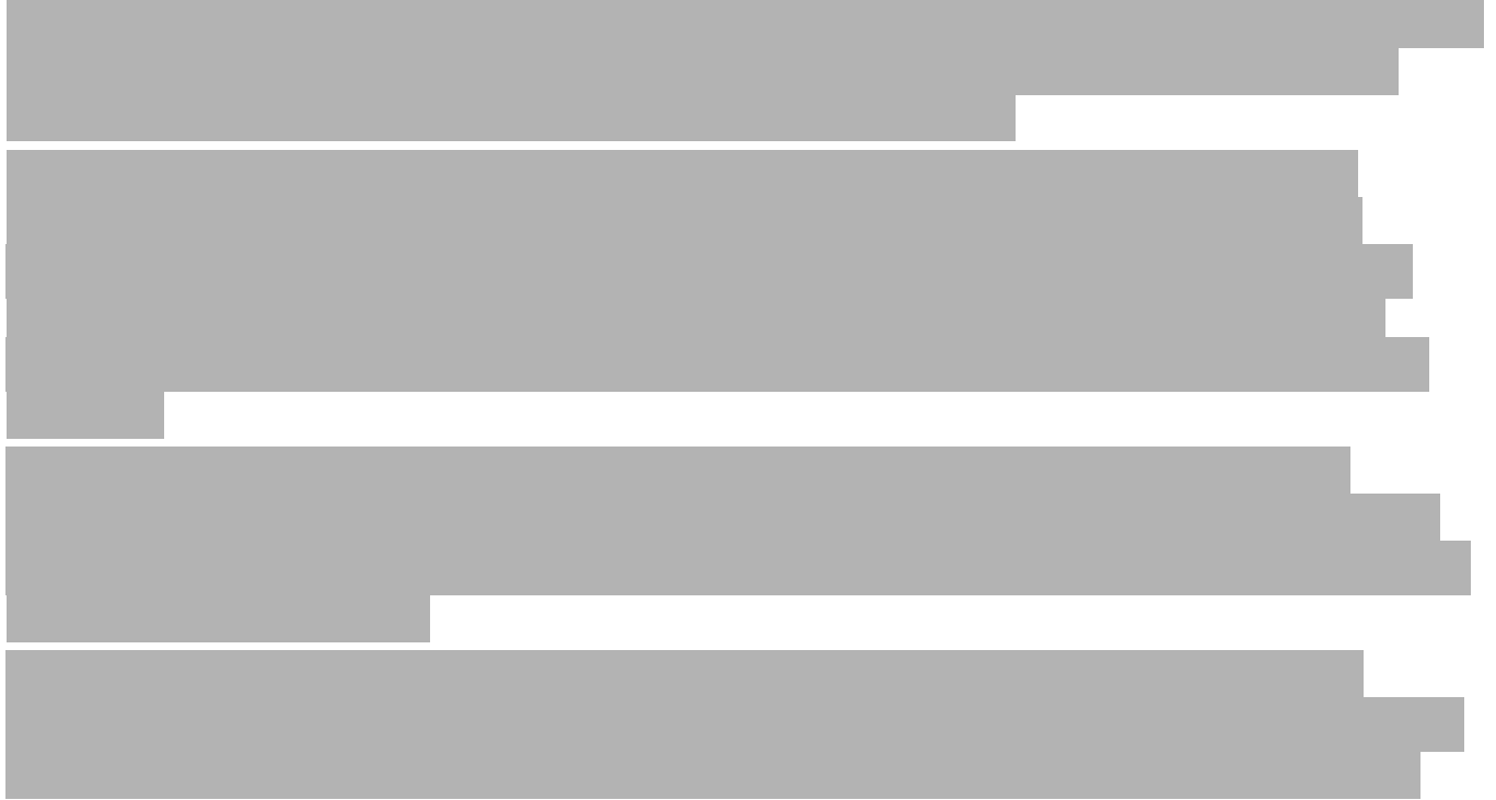
Figure 2: Is the MBTI assessment reliable?

The MBTI assessment is supposed to measure personality type and then to be used as a tool for