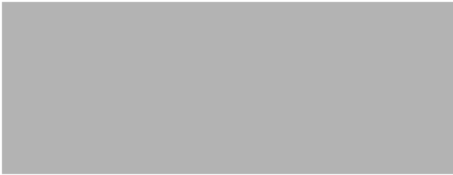
Single comb on a chicken