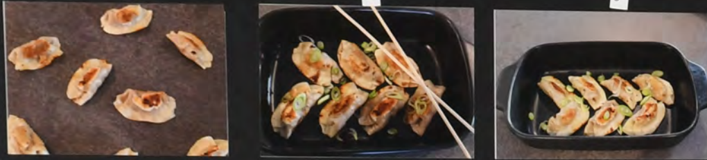
Photos 1,2,3,8,10 were taken by me. Photos 4,5,6,7,9 are sourced from the internet.

Design Brief The design proposition is a magazine publication. The first book will be to design a magazine for the publication. Experience with the subject matter and appropriate design solutions will be provided to enable the publisher to recognize the aesthetic concerns. This is especially important for you to write or source from books or the internet, especially the subject of street food. The design solutions will be used in the magazine which will give the client a clear vision of the magazine. The design solutions will be used in the magazine which will give the client a clear vision of the magazine. The design solutions will be used in the magazine which will give the client a clear vision of the magazine.