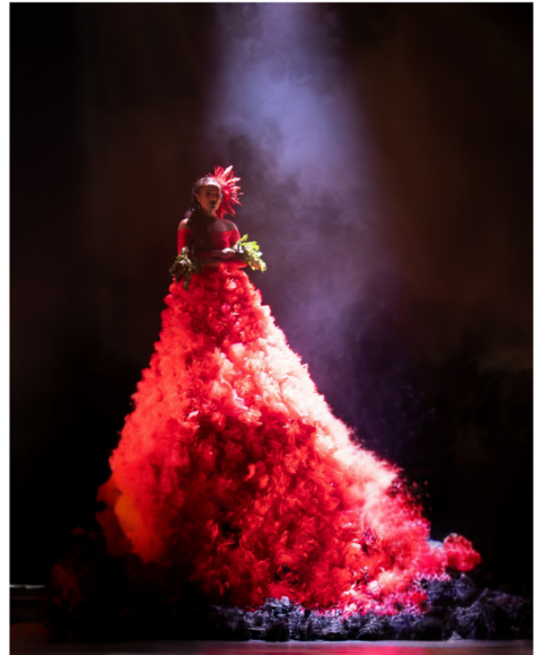
Te Kaitā: Ko Te Whare Tapere o te Arawa